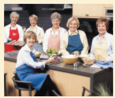
As the Best of Bridge Ladies would say, "You should have these books. We've tested, tasted and revised. We promise you'll love every recipe."

A collection of tasty, no-fail favorites, including 100 new recipes, from the bestselling Best of Bridge cookbooks