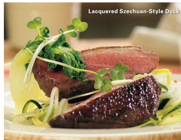
Lacquered Szechuan-Style Duck

Whether wild game is already part of your diet, or you're a home cook discovering it for the first time, this comprehensive and wide-ranging book will help you explore the hearty flavors and textures of wild game.