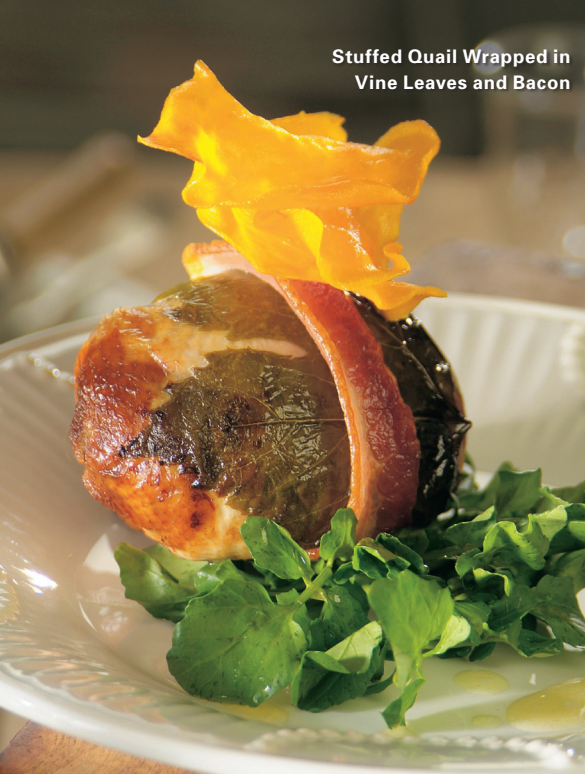
Stuffed Quail Wrapped in Vine Leaves and Bacon